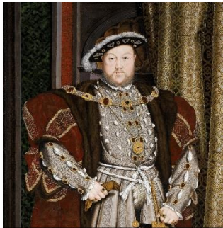
Henry VIII was one of the driving forces behind the reformation in England.

In England, the creation of an independent national church was directly powered by political events. In 1527 Henry VIII attempted to obtain a divorce from Katherine of Aragon. When the Pope would not comply, Henry adopted a solution suggested by his advisor Thomas Cromwell that he take the title of 'Supreme Head of the English Church'. Monasteries were forcibly disbanded and images and shrines were destroyed (in attacks known as iconoclasm). Henry's Roman Catholic Lord Chancellor, Thomas More, who had refused to accept Henry's supremacy of the church, was executed and the Bible appeared in English for the first time. However, it was not until the accession of the boy king Edward VI that the English