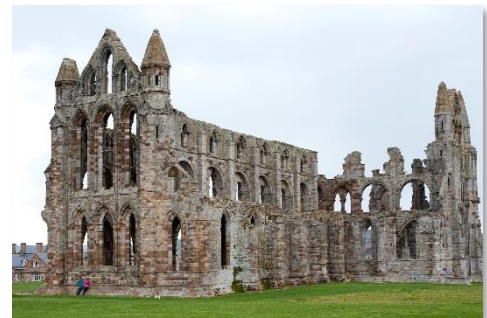
Whitby abbey – a once proud abbey lies as an empty shell as a result of Henry VIII's actions

Protestant Reformation touched the lives of the people of the realm more widely. Under a protectorate of Protestant nobles, significant religious reforms were executed in the king's name. A Book of Common Prayer was issued in English and over the period 1547–1553 the structure of church ceremonies was simplified. The appearance of parish churches continued to be drastically transformed; communion tables replaced altars, images were removed, the king's royal arms were installed and walls once filled with paintings were whitewashed.