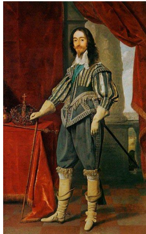
Charles I (1603-1649)