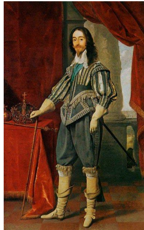
Charles I (1603-1649)