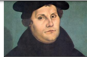
German Theologian Martin Luther was a prominent protestant voice

In order to be able to understand England in the 1620s we need to understand the religious context. You will have studied this before but these tasks just bring you up to speed with the core concepts.