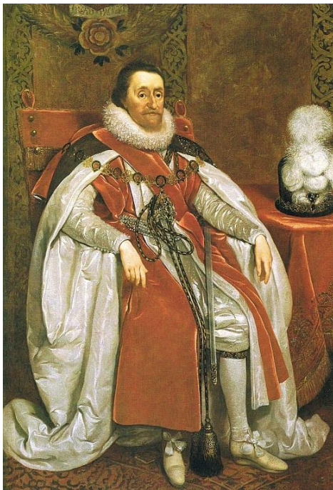
James I (1603-1625)