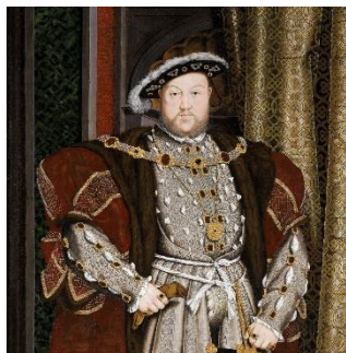
Henry VIII was one of the driving forces behind the reformation in England.

In England, the creation of an independent national church was directly powered by political events. In 1527 Henry VIII attempted to obtain a divorce from Katherine of Aragon. When the Pope would not comply, Henry adopted a solution suggested by his advisor Thomas Cromwell that he take the title of 'Supreme Head of the English Church'. Monasteries were forcibly disbanded and images and shrines were destroyed (in attacks known as iconoclasm). Henry's Roman Catholic Lord Chancellor, Thomas More, who had refused to accept Henry's supremacy of the church, was executed and the Bible appeared in English for the first time. However, it was not until the accession of the boy king Edward VI that the English